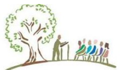
Outdoor Worship Service

Our Church Council discussed having an outdoor worship service/picnic and we've chosen it to be on July 18 th at 10 AM at Highland Park . Due to continuing COVID19 carefulness we are thinking it would be easier for everyone to just bring their own food with them to eat during the fellowship time following the service. (Any food you may want to share with others must be prepackaged in individual servings for folks to take.) Plan to attend!